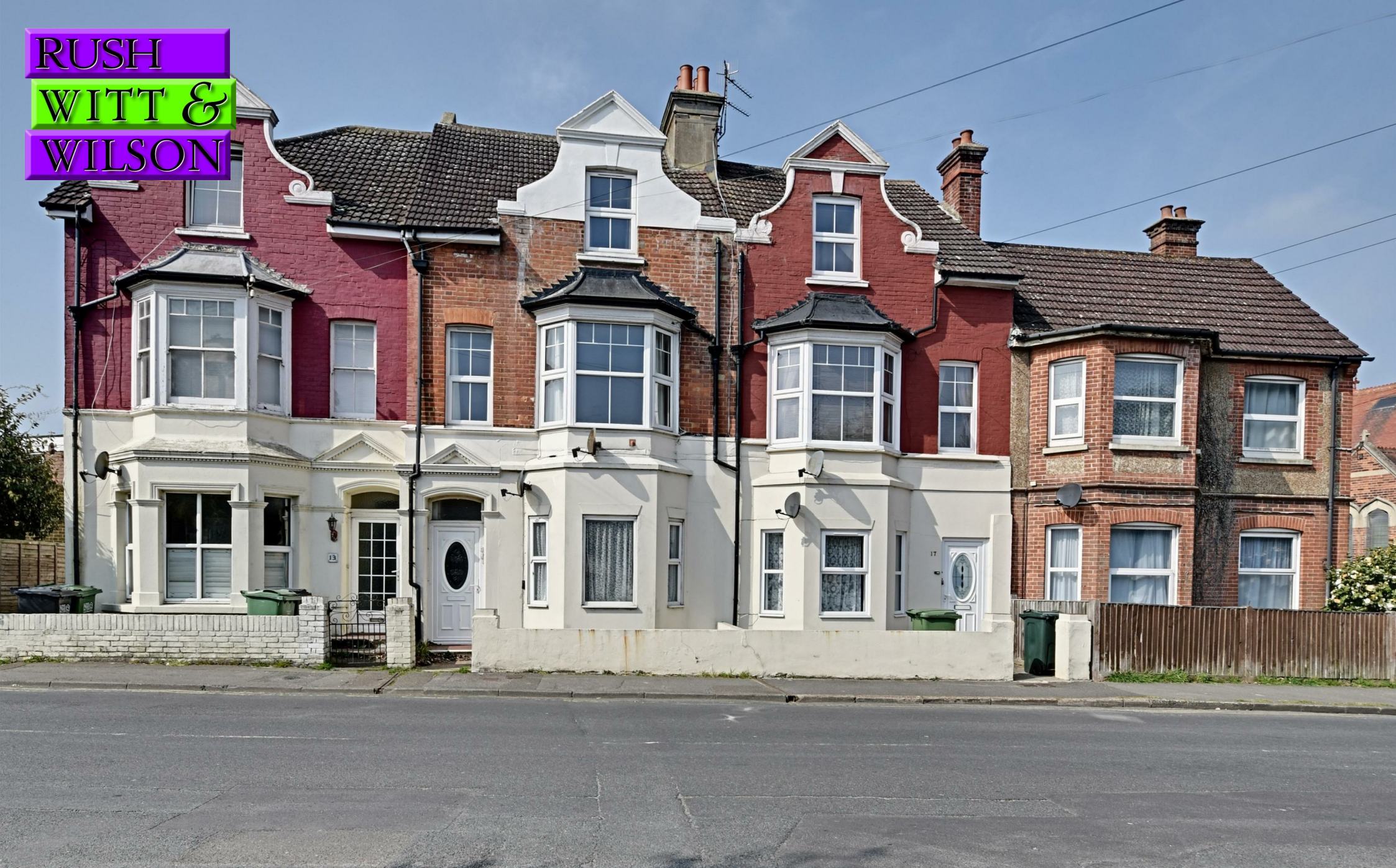
Flat B, 15 Holliers Hill, Bexhill-On-Sea, East Sussex TN40 2DY £195,000