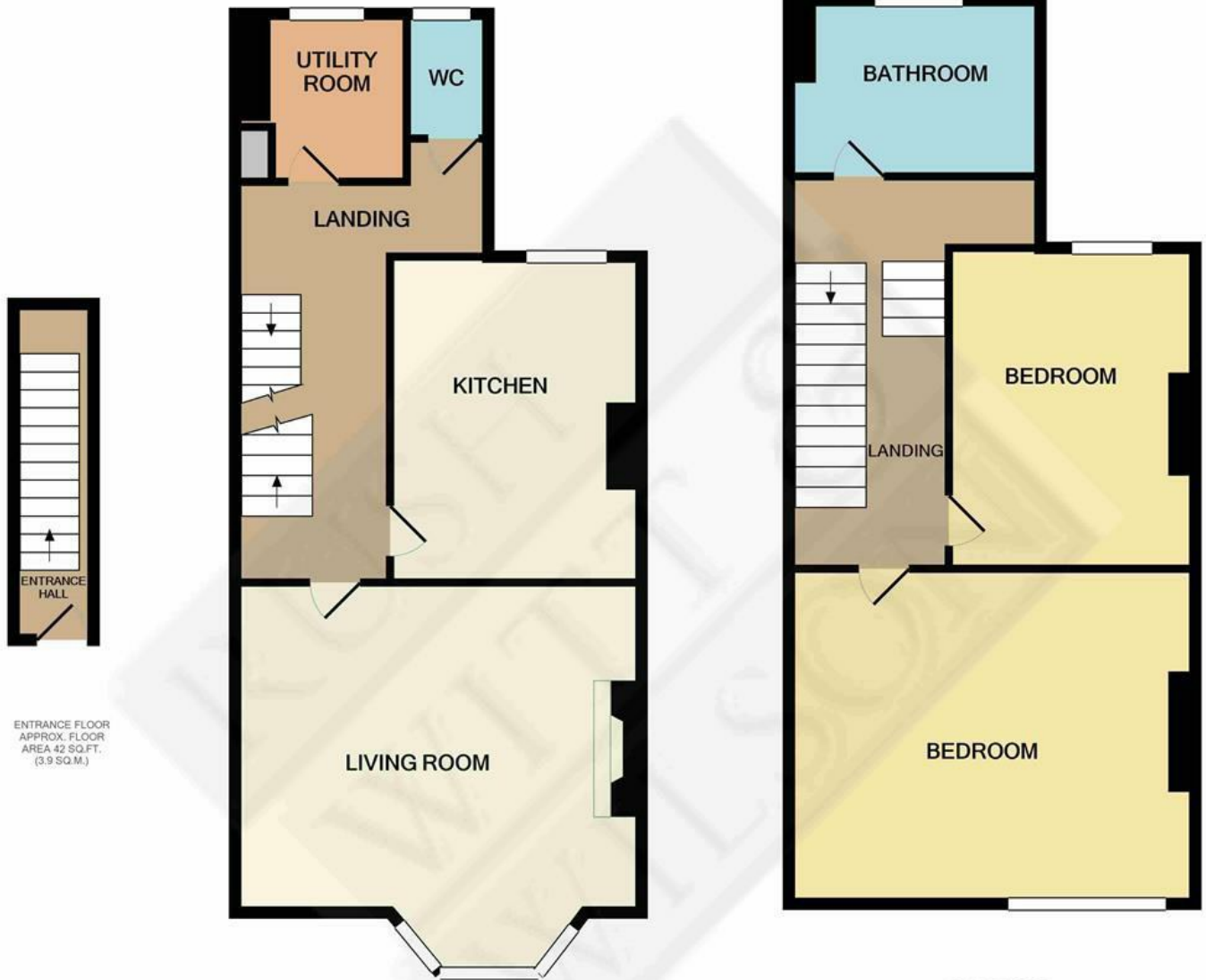
ENTRANCE FLOOR APPROX. FLOOR AREA 42 SQ.FT. (3.9 SQ.M.)